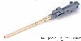
The photo is for illustrative purposes only. The actual product may differ and are not painted.