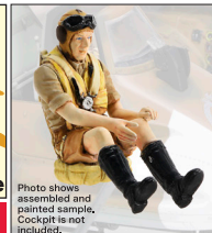
Photo shows assembled and painted sample. Cockpit is not included.